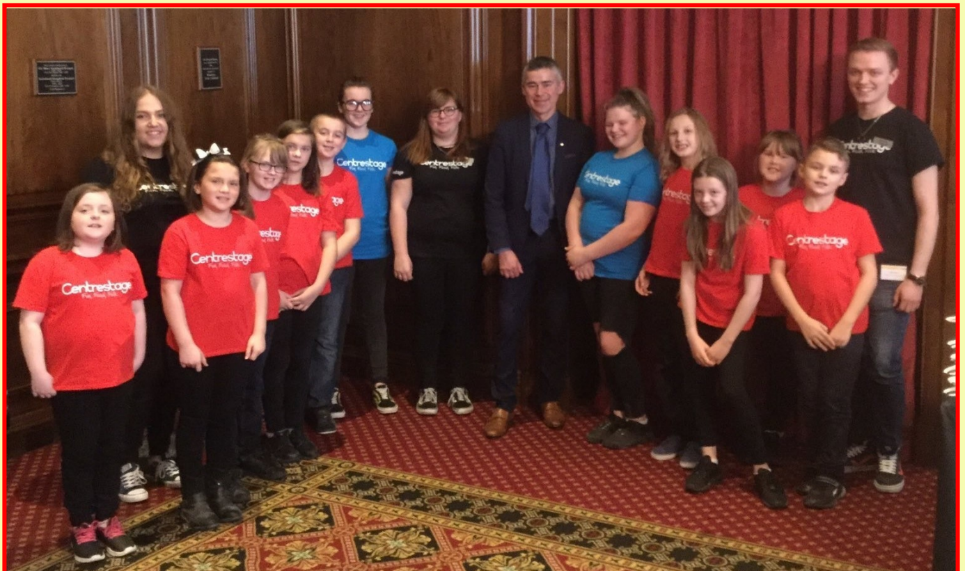
Team Shortlees from Centrestage visit Westminster

It was great to see and co-incidentally was held at the headquarters of the Institution of Civil Engineers, so I was able to encourage the kids to take in a tunnelling exhibition upstairs too, given I am still a chartered engineer I thought I might as well see if there is a future budding engineer! Well done to all involved especially the young helpers who helped make the trip possible from a supervision perspective.