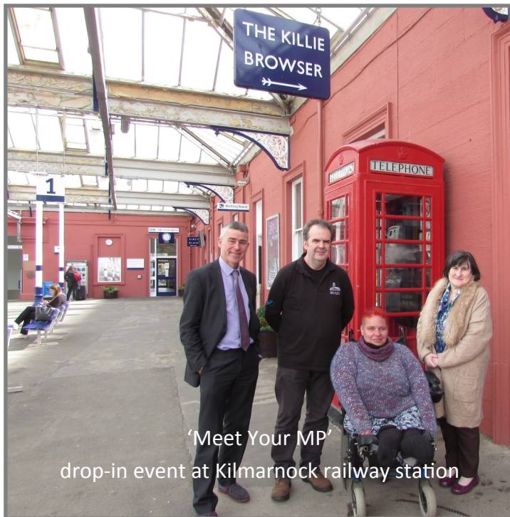
'Meet Your MP' drop-in event at Kilmarnock railway station