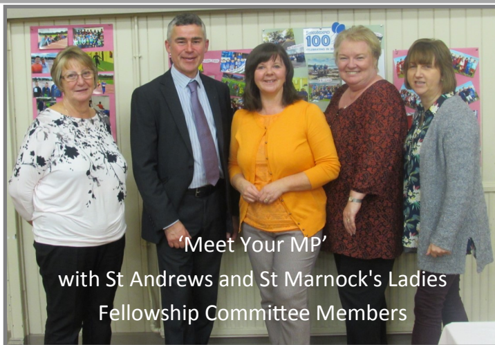
'Meet Your MP' with St Andrews and St Marnock's Ladies Fellowship Committee Members

I recently participated in a "Meet your MP" event with the St Andrews and St Marnock's Ladies Fellowship group. I thoroughly enjoyed my evening and if any other group ever wishes to invite me along for a Question and Answer session I am more than happy to oblige.