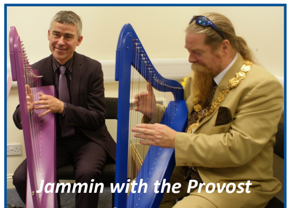
Jammin with the Provost