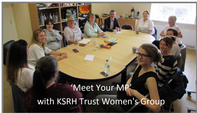
'Meet Your MP' with KSRH Trust Women's Group