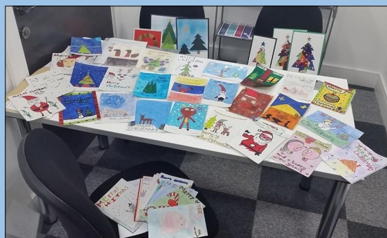
Some of the many excellent pictures sent in from students of Park School, Kirkstyle Primary, St. Patricks Primary, St. Sophia's Primary and Newmilns Primary

I would like to thank all the pupils and teachers for taking part this year and congratulations to everyone on their brilliant designs.